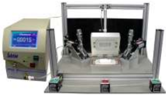
TME Solution-C non-destructive leak tester with custom fixture for testing pharmaceutical bottles