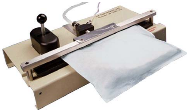
TS-01 12" Open Package Fixture